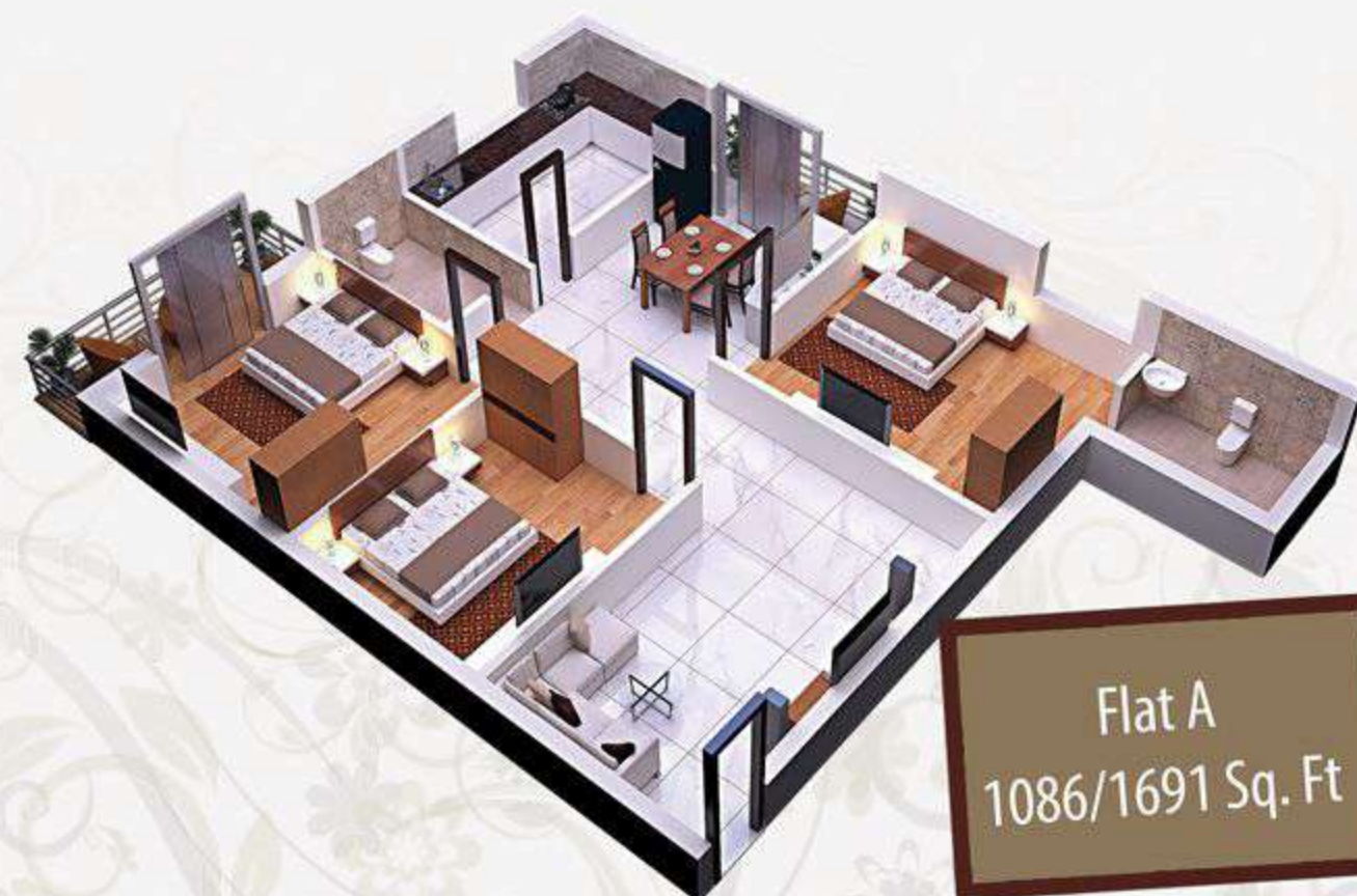
Flat A 1086/1691 Sq. Ft