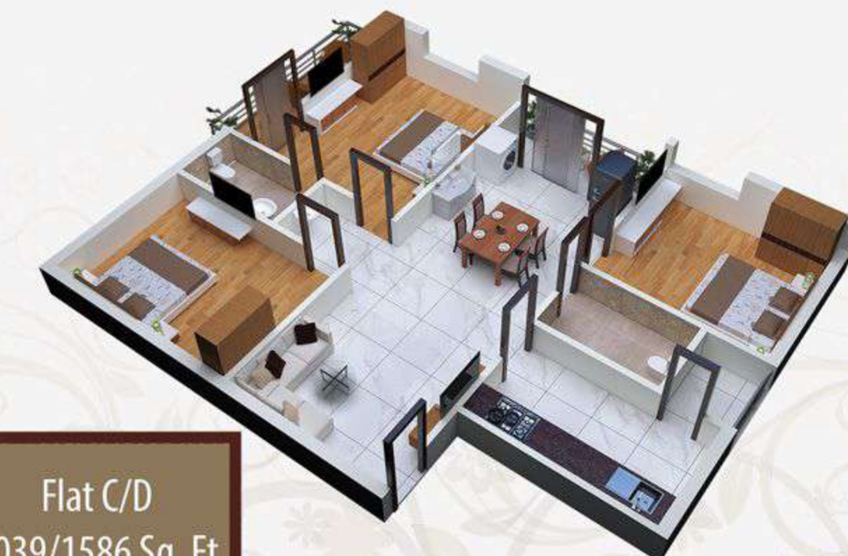
Flat C/D 1039/1586 Sq. Ft