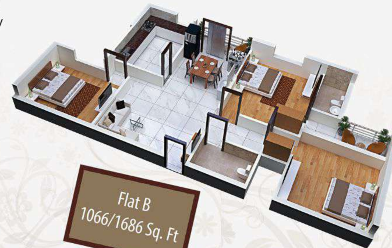
Flat B 1066/1686 Sq. Ft