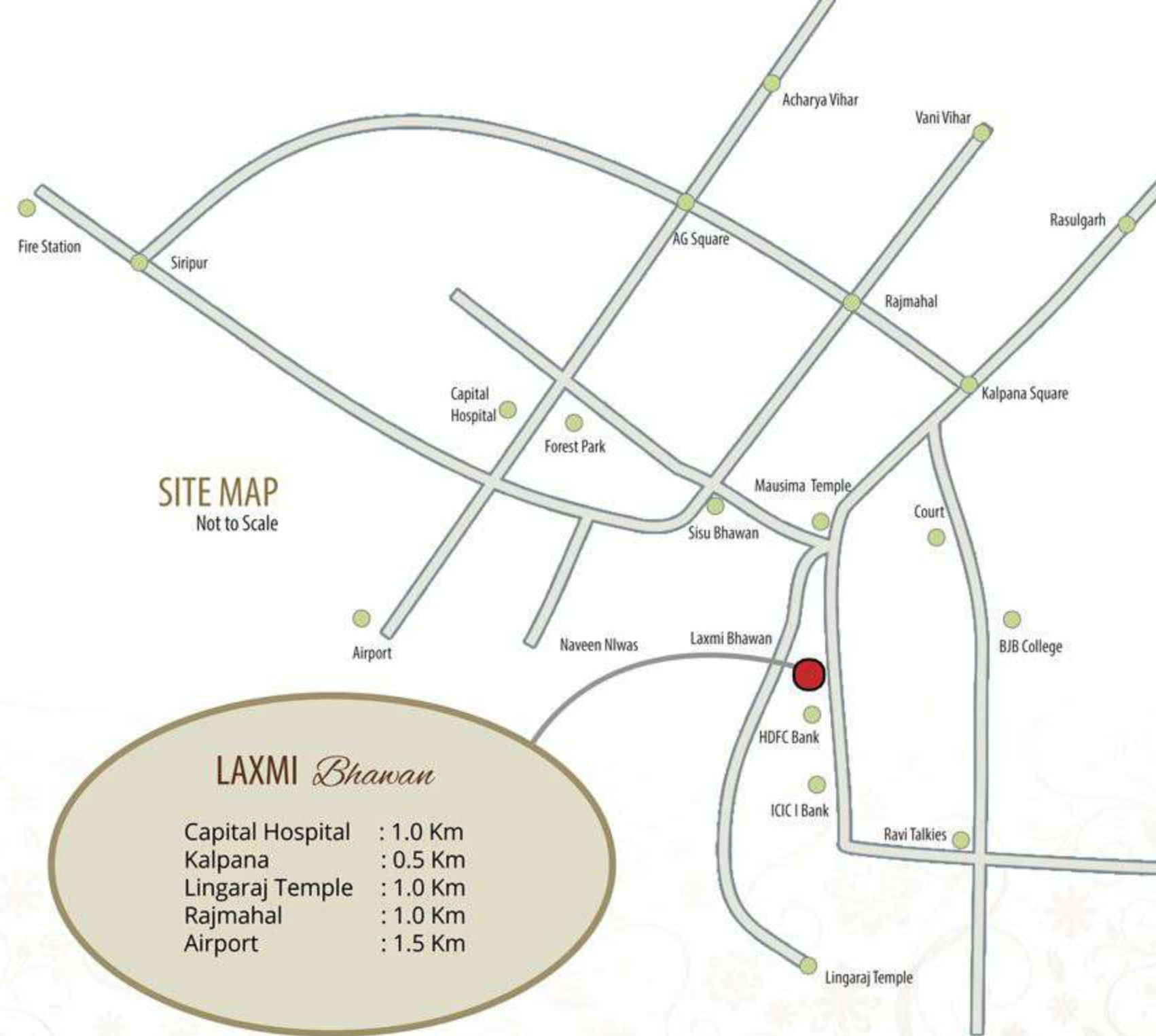
SITE MAP Not to Scale